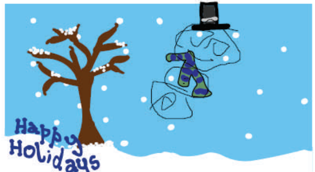
By: Kindergarten student: Kaveh Room 12

The Kindergarten and Grade 1 have developed strong skills in computer basics. The Kindergarten kids have mastered eye hand coordination, logging in, and click & drag mouse controls. They will be using the internet to review Math and English this month. The First graders will be introduced to MS Word this month-A BIG STEP! The Second graders are working on a Power Point project - a Family tree presentation. They will be learning all the basics to Power Point. The Third graders are finishing an Invitation and Menu project. They will be starting on a project with the Unit- Imagination. They will be imagining themselves as someone or something else; then they will create/draw a picture and compose a poem. The Fourth graders are doing research on the Unit-Medicine; they will make a final presentation using Power Point.